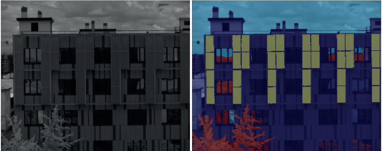
Example of Hyperspectral Imaging for remote sensing. The image on the right is the result of a classification algorithm, which distinguishes the sky (light blue), the buildings (purple), the tree (and their reflections in the windows of the building, in red) and the solar panels (in yellow).